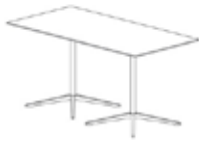
A647DP Rectangular table with diagonal pedestals. Laminate face Polished cast Aluminium/ Chrome column Dimensions: A647DP/157 737h 1500w 750d A647DP/187 737h 1800w 750d A647DP/189 737h 1800w 900d