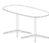
A647D Soft rectangular table with diagonal pedestals. Laminate face Polished cast Aluminium/ Chrome column Dimensions: A647D/157SR 737h 1500w 750d A647D/187SR 737h 1800w 750d A647D/189SR 737h 1800w 900d