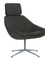
A641 Lounge chair with headrest Upholstered seat Polished aluminium base with chrome steel centre column

Dimensions: Overall 770h 780w 820d Seat 460h Weight 16.5kg