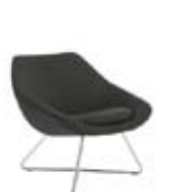
A642 Lounge chair Upholstered seat Polished chrome wire frame

Dimensions: Overall 1050h 780w 860d Seat 460h Weight 19.0kg