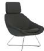
A642 Lounge chair with headrest Upholstered seat Polished chrome wire frame

Dimensions: Overall 770h 745w 760d Seat 460h Weight 15.0kg