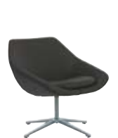
A640 Lounge chair Upholstered seat Polished aluminium base with chrome steel centre column

Dimensions: Overall 770h 780w 820d Seat 460h Weight 16.5kg