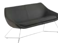
A644 Sofa Upholstered seat Polished chrome wire frame

Dimensions: Overall 1050h 745w 800d Seat 460h Weight 16.0kg