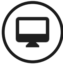
Media / Technology