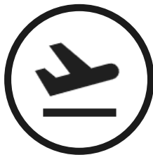
Airport / Transportation