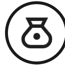
Financial / Legal